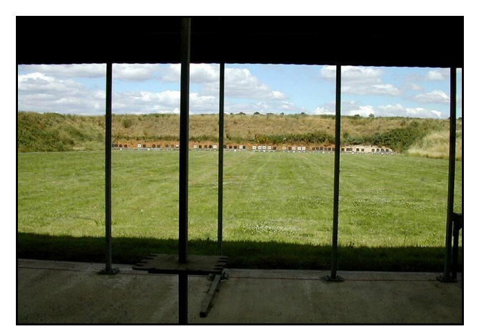
The 100m range at Wedgnock has 50 firing points, all under cover.

Wedgnock is the home range of the Muzzle Loaders Association of Great Britain and is located about 5 minutes from Junction 15 of the M40. Take the A46 towards Coventry for one junction. Turn right towards Warwick, past the IBM building on the left. Left at next roundabout, along Wedgnock Lane. Opposite Volvo (on the right), take steep narrow road signposted to Adventure Sports. The range is next to it.