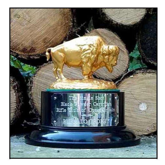
The Buffalo Trophy in all its glory. Sponsored by Geoff Hoden, this is truly a prize worth winning.

The second of the Buffalo shoots took place at Bisley on 3 August. As with the last Buff shoot back in May, the weather was unpredictable to say the least! The sun was out for the 200 yard distance in the morning but after lunch it rained for the first 3 or 4 details of the 600 yard stage. To make shooting a little more comfortable, the Club "roof" was erected over the firing point. Despite looking more like a Bedouin's tent, everyone took advantage of it! The Mark II version is already in the production stage for whatever next year's weather cares to throw at us.